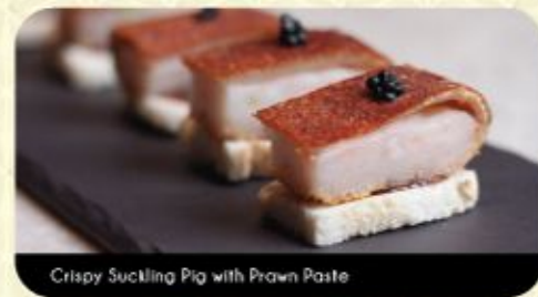
Crispy Suckling Pig with Prawn Paste