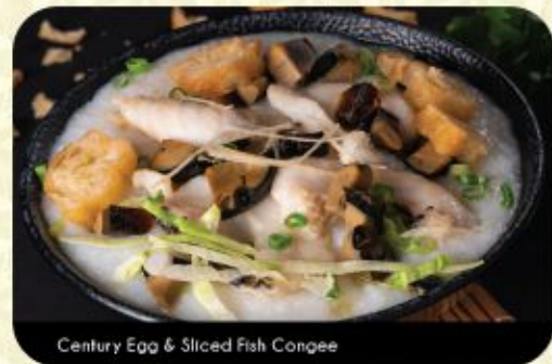
Century Egg & Sliced Fish Congee