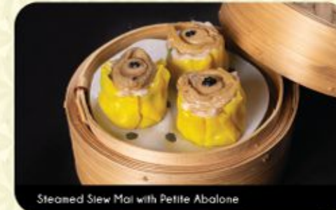
Steamed Siew Mai with Petite Abalone