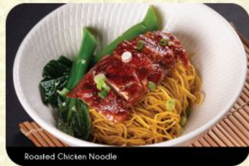
Roasted Chicken Noodle