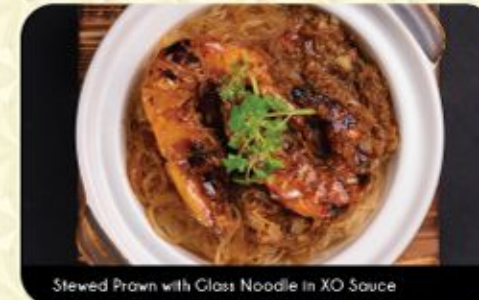
Stewed Prawn with Glass Noodle in XO Sauce