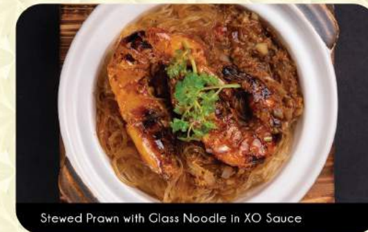
Stewed Prawn with Glass Noodle in XO Sauce