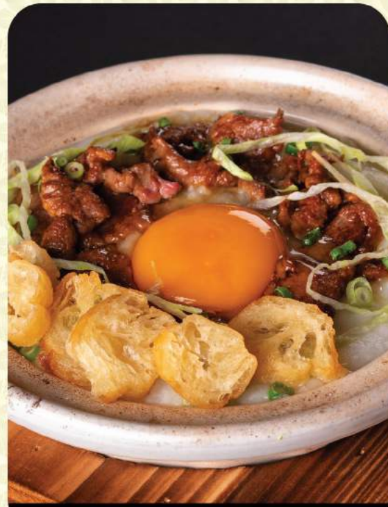
Sliced Beef with Egg Congee