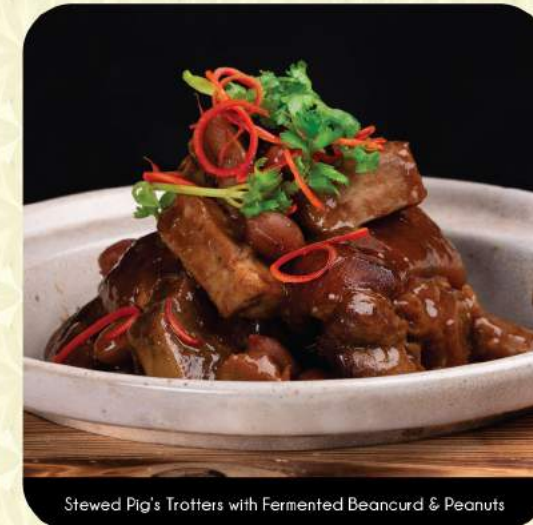
Stewed Pig's Trotters with Fermented Beancurd & Peanuts