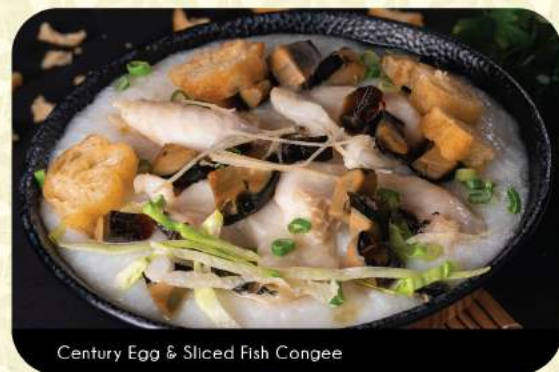
Century Egg & Sliced Fish Congee