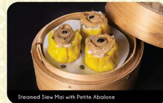
Steamed Siew Mai with Petite Abalone