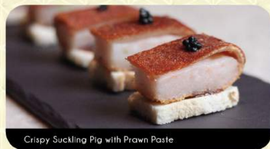
Crispy Suckling Pig with Prawn Paste